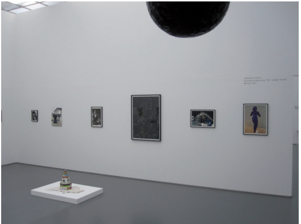
04/01/2010 Ausstellungsort: für Jung Kunst Museum IP